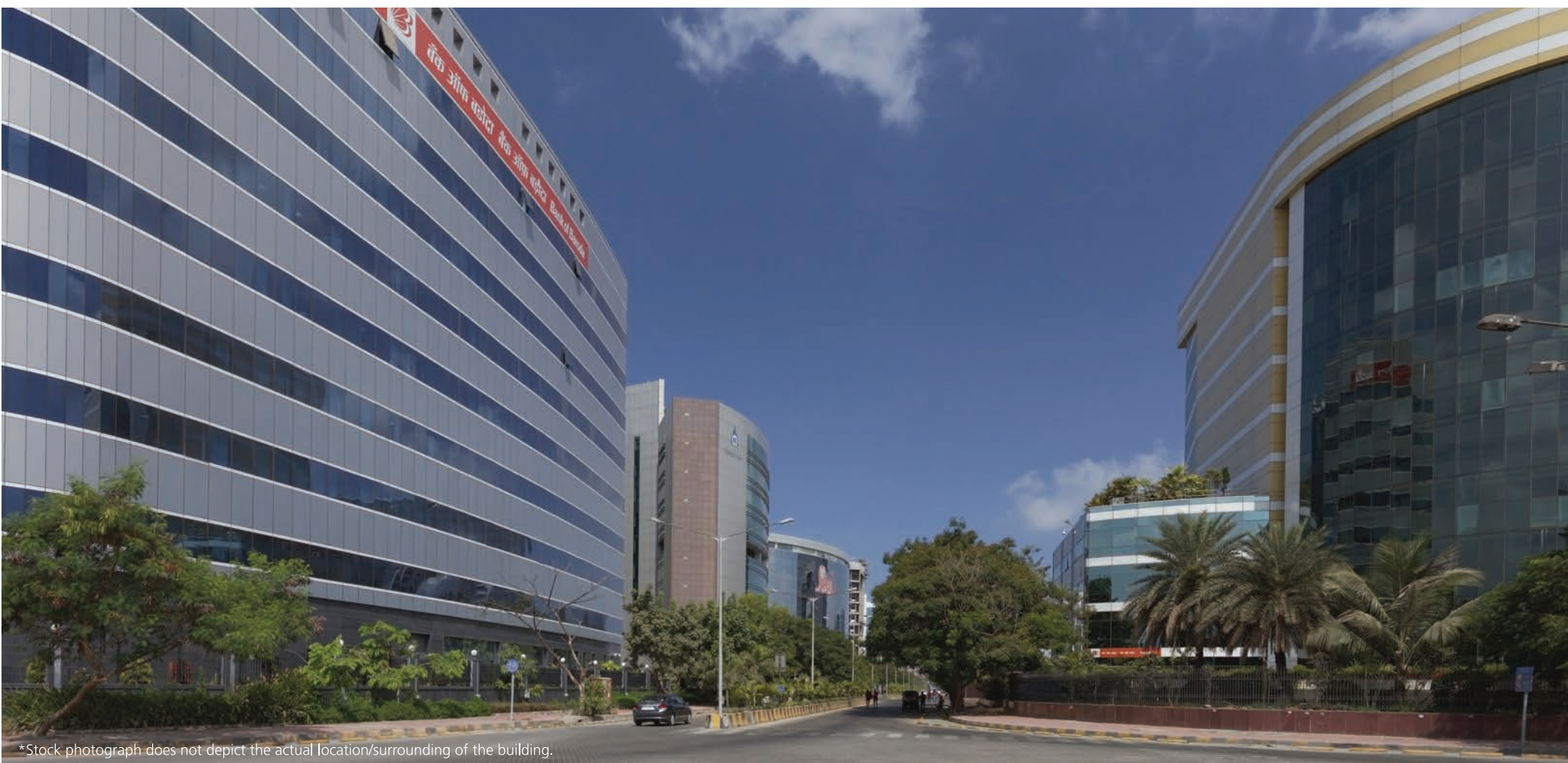
*Stock photograph does not depict the actual location/surrounding of the building.