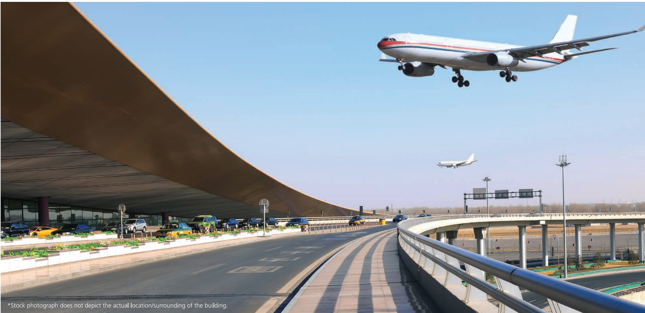
*Stock photograph does not depict the actual location/surrounding of the building.